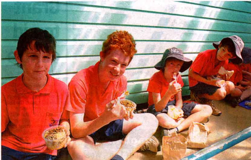
Lunchtime ... pupils at Nana Glen school tuck into additive-free food yesterday.